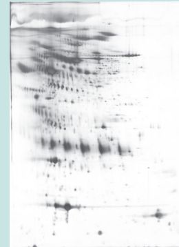
CSF with abundant protein depletion